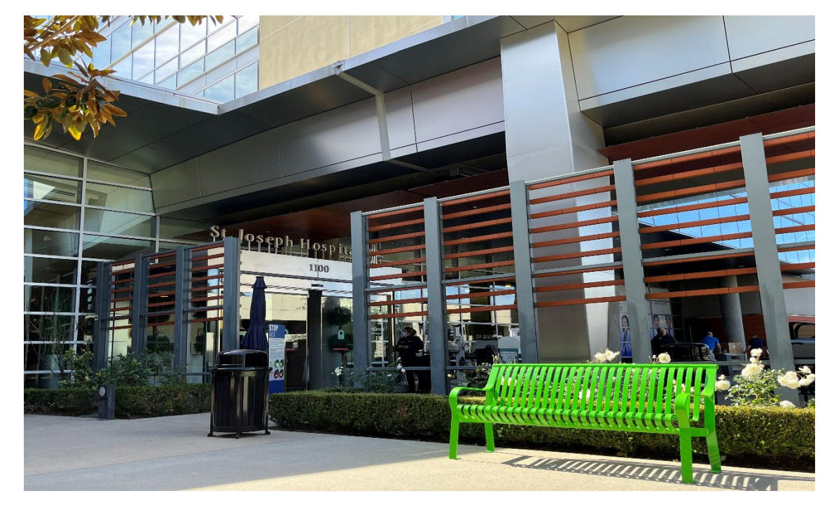
Lime Green Bench at the main hospital entrance serves as a symbol for mental health awareness <u>https://greenbenchoc.org</u>

To provide feedback on this CHIP or obtain a printed copy free of charge, please email Cecilia Bustamante Pixa at <u>Cecilia.Bustamante-Pixa@stjoe.org</u>