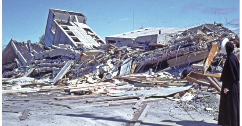
A Sister of Providence surveys damage on the day following the Good Friday Earthquake in Anchorage, March 28, 1964. Image #160.F21.2.

For more images, search "earthquakes" on our digital collections database at http://providencearchives.contentdm.oclc.org/ . ♦