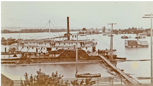
This photo, showing the aftermath of the Great Flood on the bank of the Columbia River, belonged to Charles Williams. The steamer Undine is shown here along with several houses and other buildings flooded to the first floor. Photo courtesy of Clark County Historical Museum, cchm04127.

The "Great Flood of 1894" is the highest flood ever recorded along the Columbia River. On June 7, the official flood level at Vancouver was 34.4 feet. For