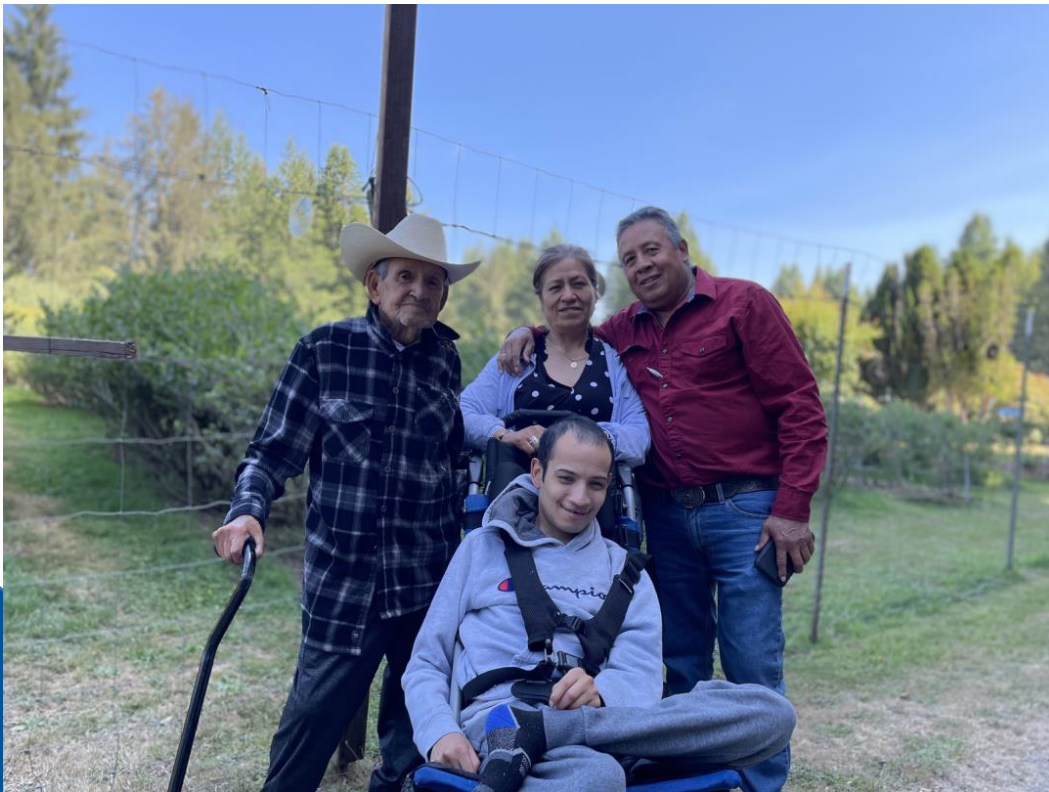
Pictured with permission: Family at the Paso a Paso Blueberry Farm event