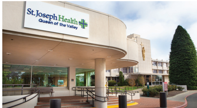
Queen of the Valley Medical Center Napa, CA

Queen of the Valley Medical Center, a 208-bed Level III trauma center based in the City of Napa, opened its doors in 1958.