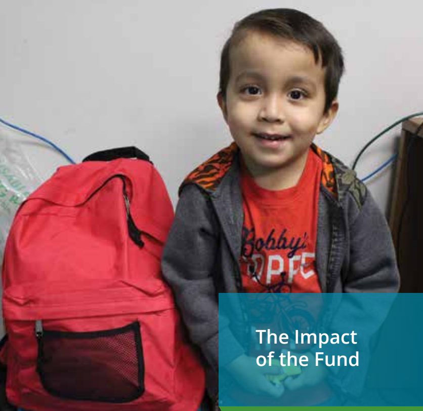
The Impact of the Fund