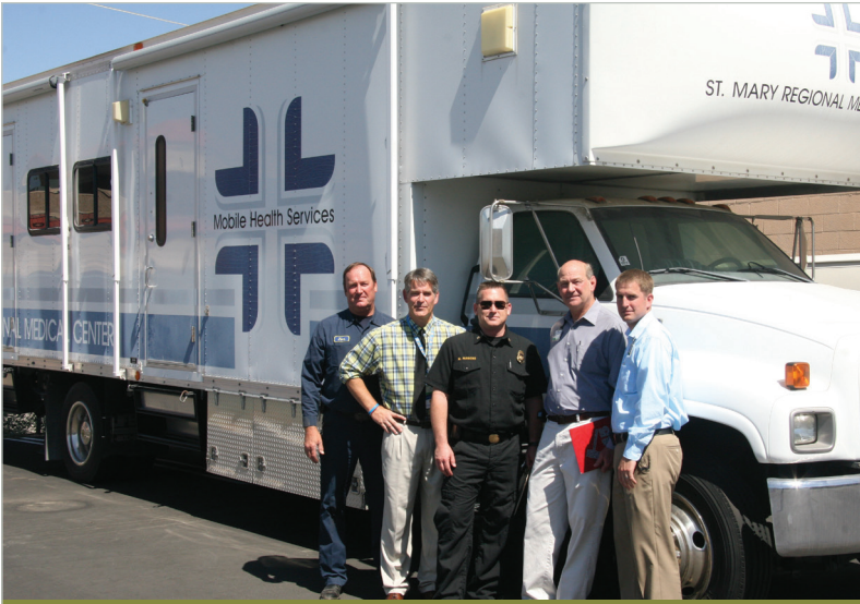
A St. Mary mobile medical unit is donated to Lastonnac Clinic to be used as a health clinic serving the poor. Apple Valley Fire Department will turn a hospital medical unit into a mobile emergency operations center responding to fires and natural disasters.