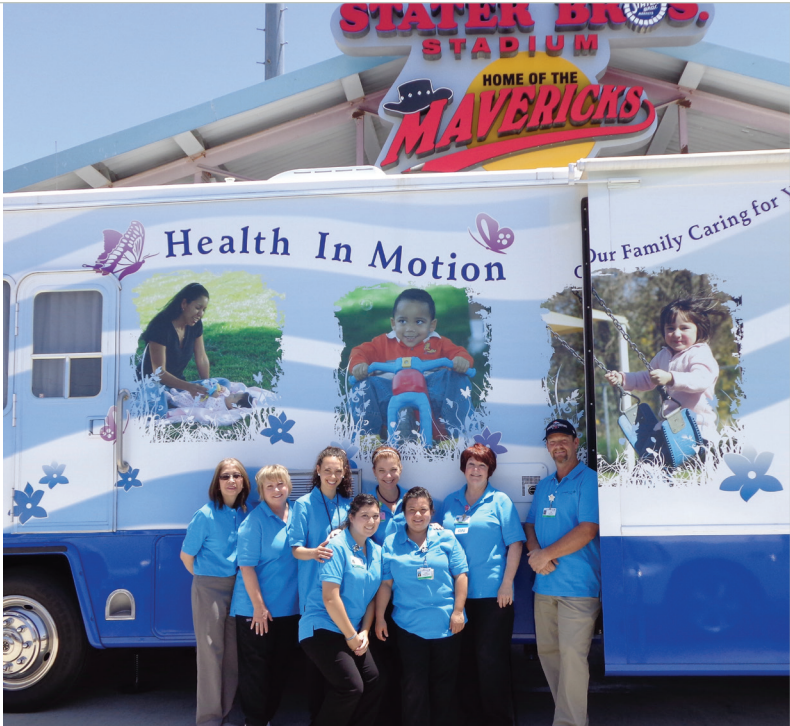
The hospital’s Bright Futures Mobile Van expands access to care and provided 8,633 patient encounters in the communities of Adelanto, Apple Valley, Hesperia and Victorville with services providing primary care, cancer detection and diabetes screenings.