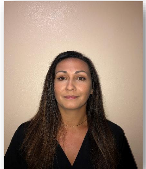
Example photo that meets all requirements and was taken using a smartphone camera.

Please rename the file with the student's name and email to Emily.Johnson@providence.org with your paperwork.