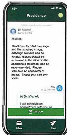
Message with your provider