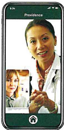
Have a video visit with your provider