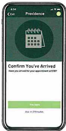
Save time by checking in

Access your health info and get care, wherever you are.