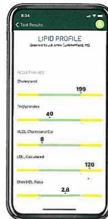
View your lab and test results