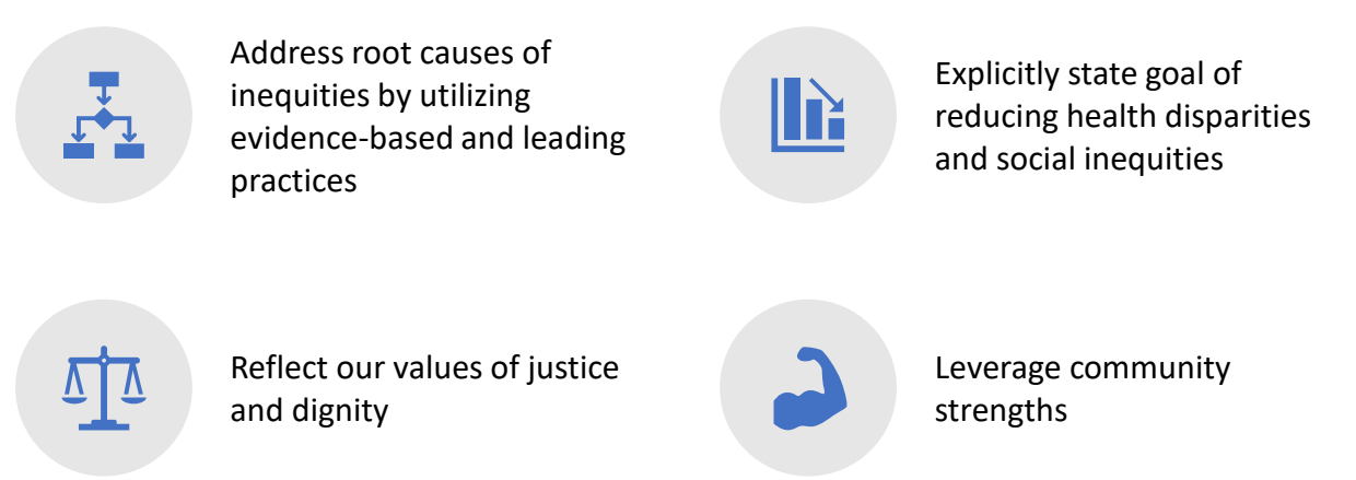
Figure 1. Best Practices for Centering Equity in the CHIP

To ensure that equity is foundational to our CHIP, we have developed an equity framework that outlines the best practices that each of our hospital will implement when completing a CHIP. These practices include, but are not limited to the following: