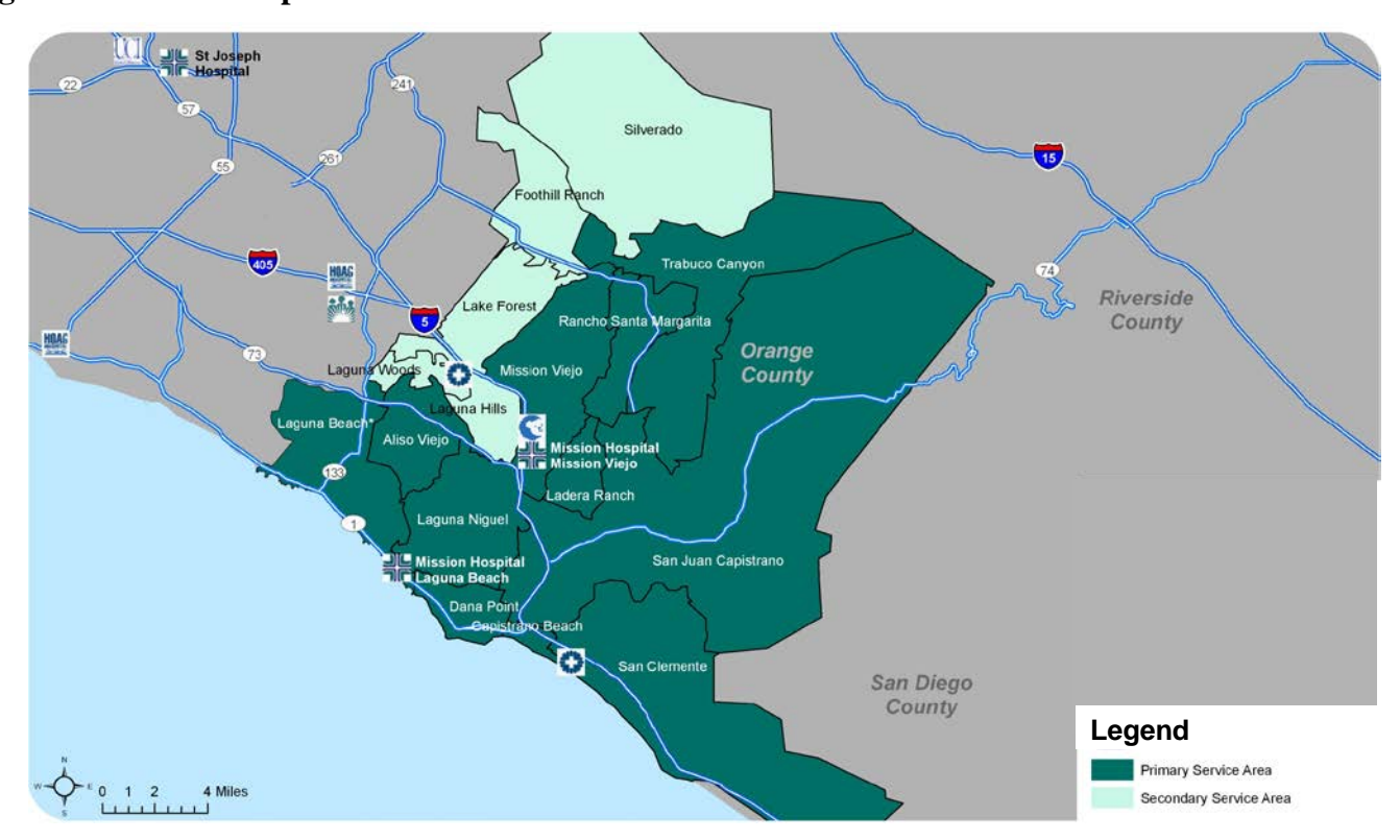
Figure 1. Mission Hospital Total Service Area

Figure 1 (below) depicts the Hospital's PSA and SSA. It also shows the location of the Hospital as well as the other hospitals in the area that are a part of St. Joseph Health.