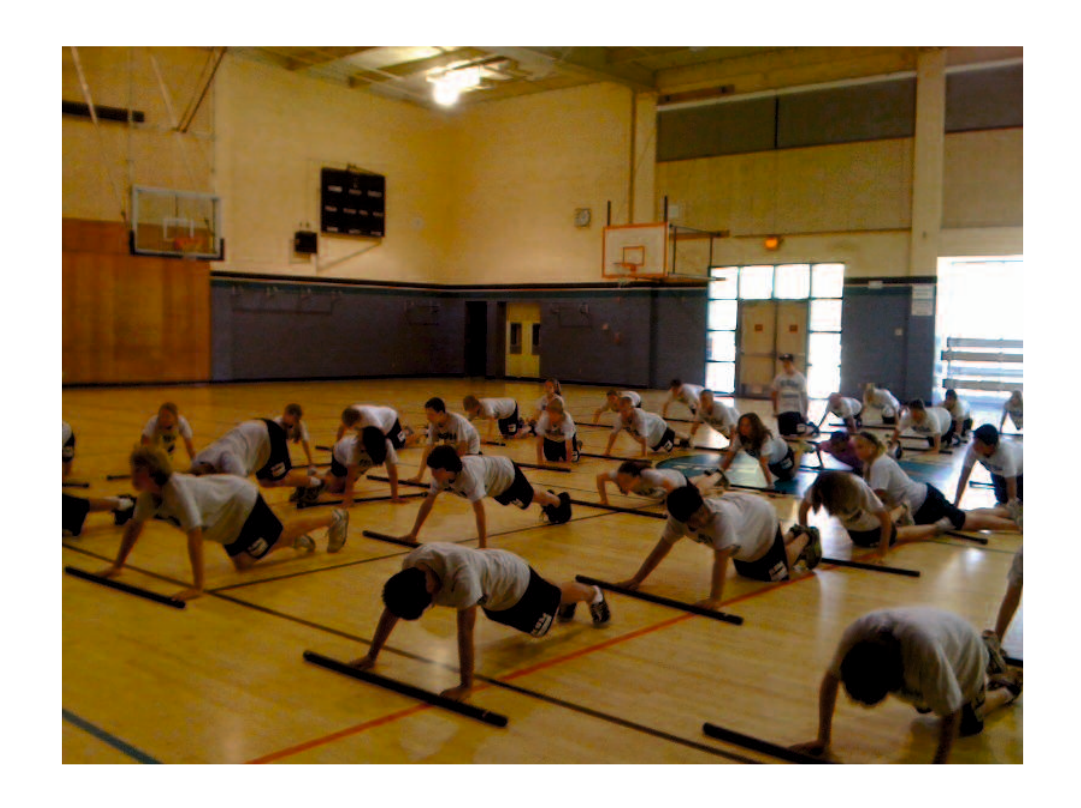
Healthy For Life: A Childhood Obesity Prevention & Intervention Program

St. Joseph Health, St. Joseph Hospital Orange FY 12 – FY 14 Community Benefit Plan/ Implementation Strategy