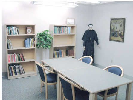
Researchers will have full use of the reference room including outlets for portable computers. On display are a sister's habit and historical artwork.

scholarly, also ranks high among priorities.