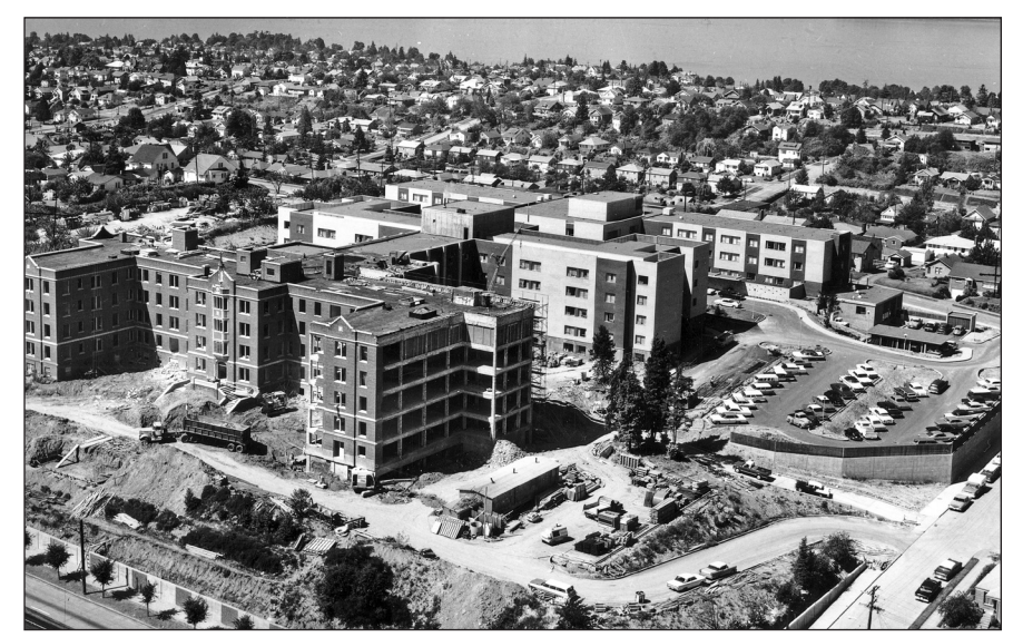
View west shows completed SJR in background; west portion of the Mount completed in center; and east portion of Mount under construction, 1967. Image #140.A3.7

A closer view shows the transformation of the Mount, with the east wing (left) completely stripped of the old exterior and the west wing (right) faced with new brick. Note the chapel windows in center. Image #140.A3.11