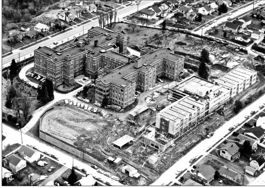
View southeast shows SJR under construction at right, 1965. Image #140.A3.2