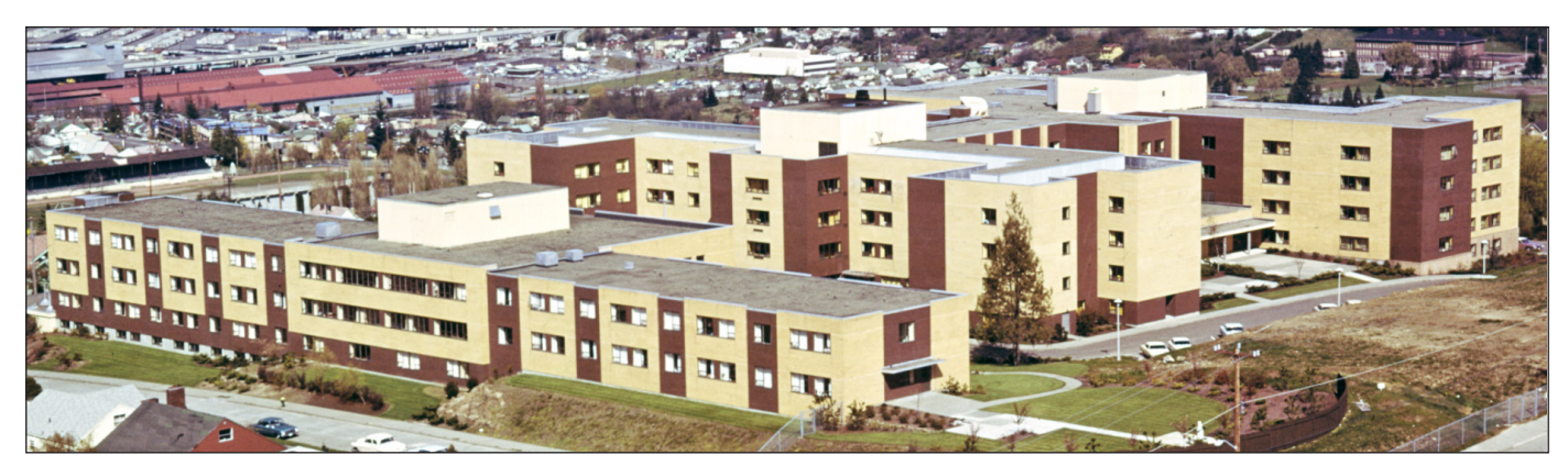
View northeast after project completion shows both SJR (foreground) and the Mount with unified architectural style. Image #140.A4.31