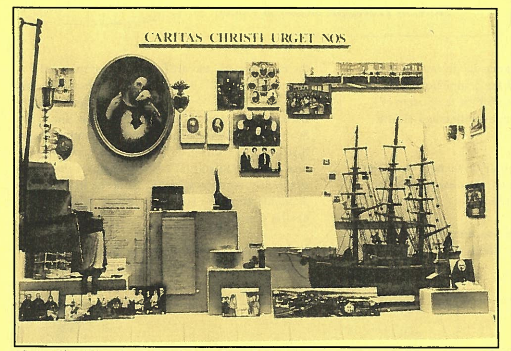
"Caritas Christi Urget Nos." Foundation and growth of ministry in the Northwest exhibit

Beginning Monday, March 21, the process of exhibit installation began. Minor glitches were overcome and by Friday afternoon, with display case glass installed, all were able to reflect on a job