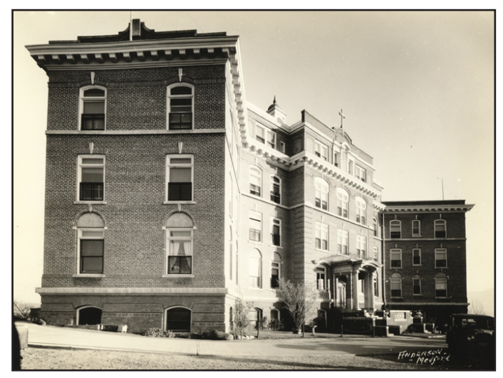
Sacred Heart Hospital now known as Providence Medford Medical Center, Medford, Ore., circa 1939 (Image #120.A2.1)

Providence Elizabeth House, Seattle, Wash.