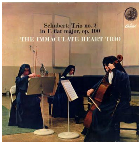
Album cover of the Immaculate Heart Trio, 1958.

Do you have a “Providence Mystery” you’d like to solve? Contact any of the archives staff for help with your research.