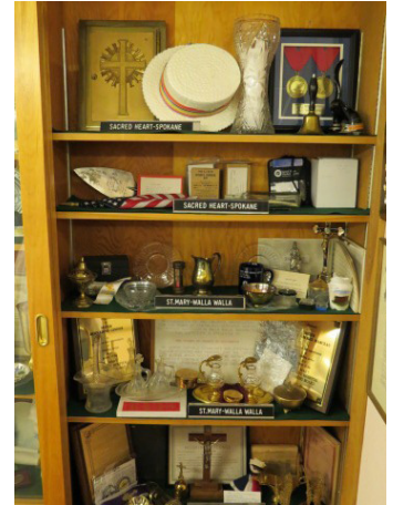
Some of the artifacts displayed in the archives at Mount St. Joseph, Spokane.

There are three goals to this cataloguing process which is detail-oriented and tedious: transfer the original handwritten accession records into an in-house database for preservation and easy access to information; evaluate artifacts for retention and disposition, and; add the catalogued artifact into the CONTENTdm database