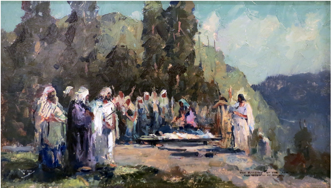
“Raising the Son of the Widow of Naim”