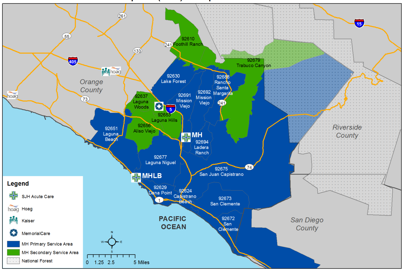
Figure 1. Mission Hospital Total Service Area Mission Hospital (MH) Hospital Total Service Area

Map represents Hospital Total Service Area (HTSA). The Primary Service Area (PSA) comprises 70% of total discharges (excluding normal newborns). The Secondary Service Area (SSA) comprises 71% - 85% of total discharges (excluding normal newborns). The HTSA combines the PSA and the SSA. Includes zip codes for continuity. Cities are placed in either PSA or SSA, but not both. MHLB = Mission Hospital Laguna Beach. Prepared by the St. Joseph Health Strategic Services Department, April 2016.