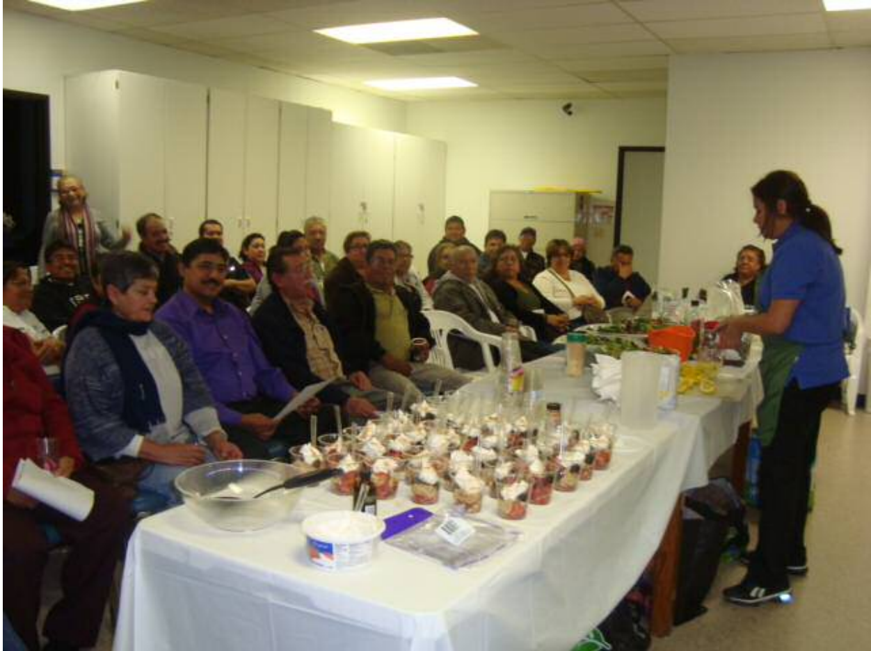
Diabetic patients and their families participating in a Cooking Demonstration Class provided by the Joint Clinic Health Education Program: El Club de Salud