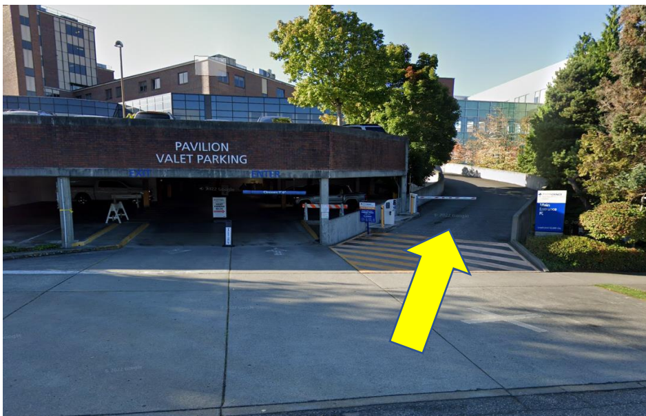
View from Federal and Pacific