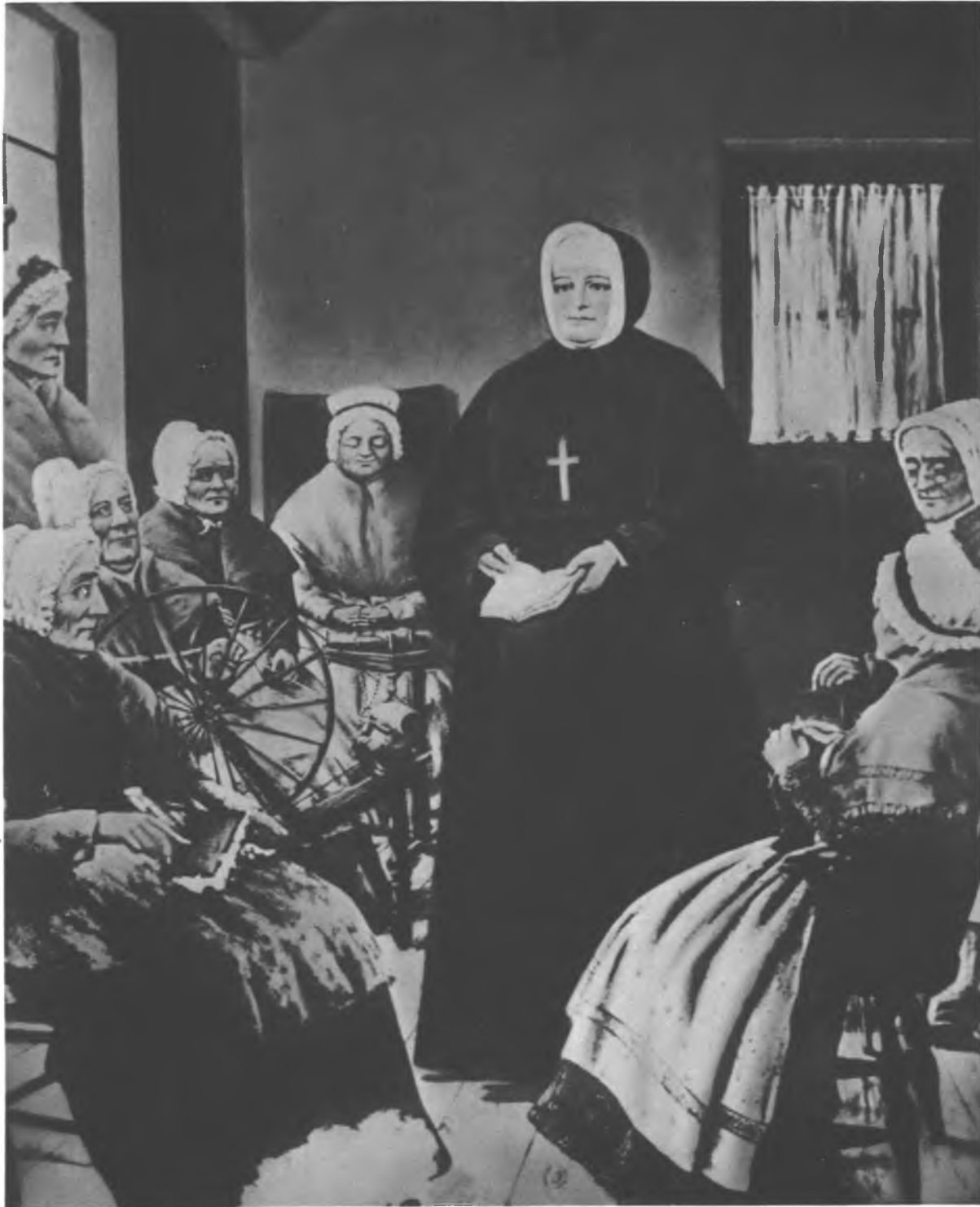
MOTHER EMILIE GAMELIN, Foundress