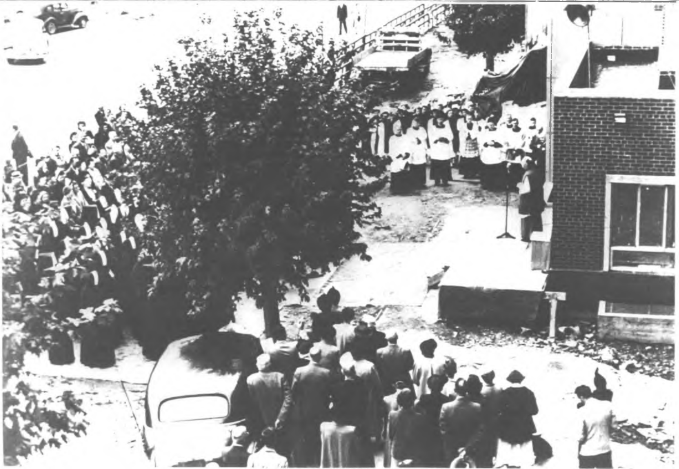
Laying of cornerstone for 1952 hospital