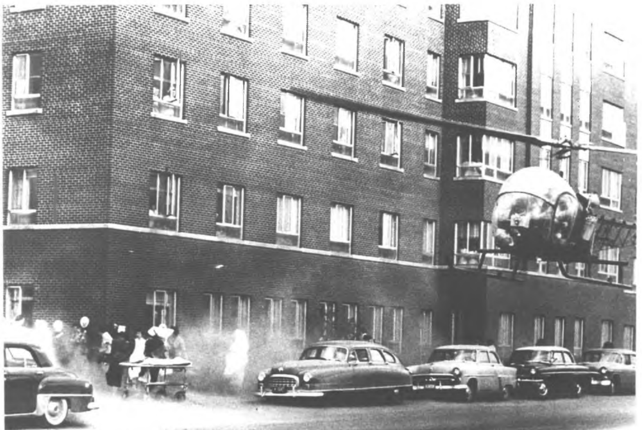
Arrival of first helicopter patient Oct. 6, 1952