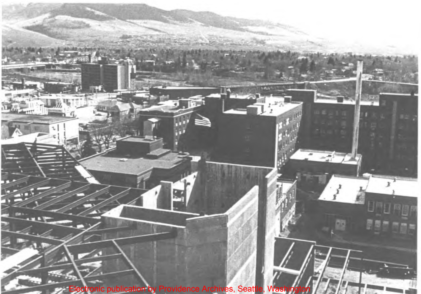
Construction of current hospital