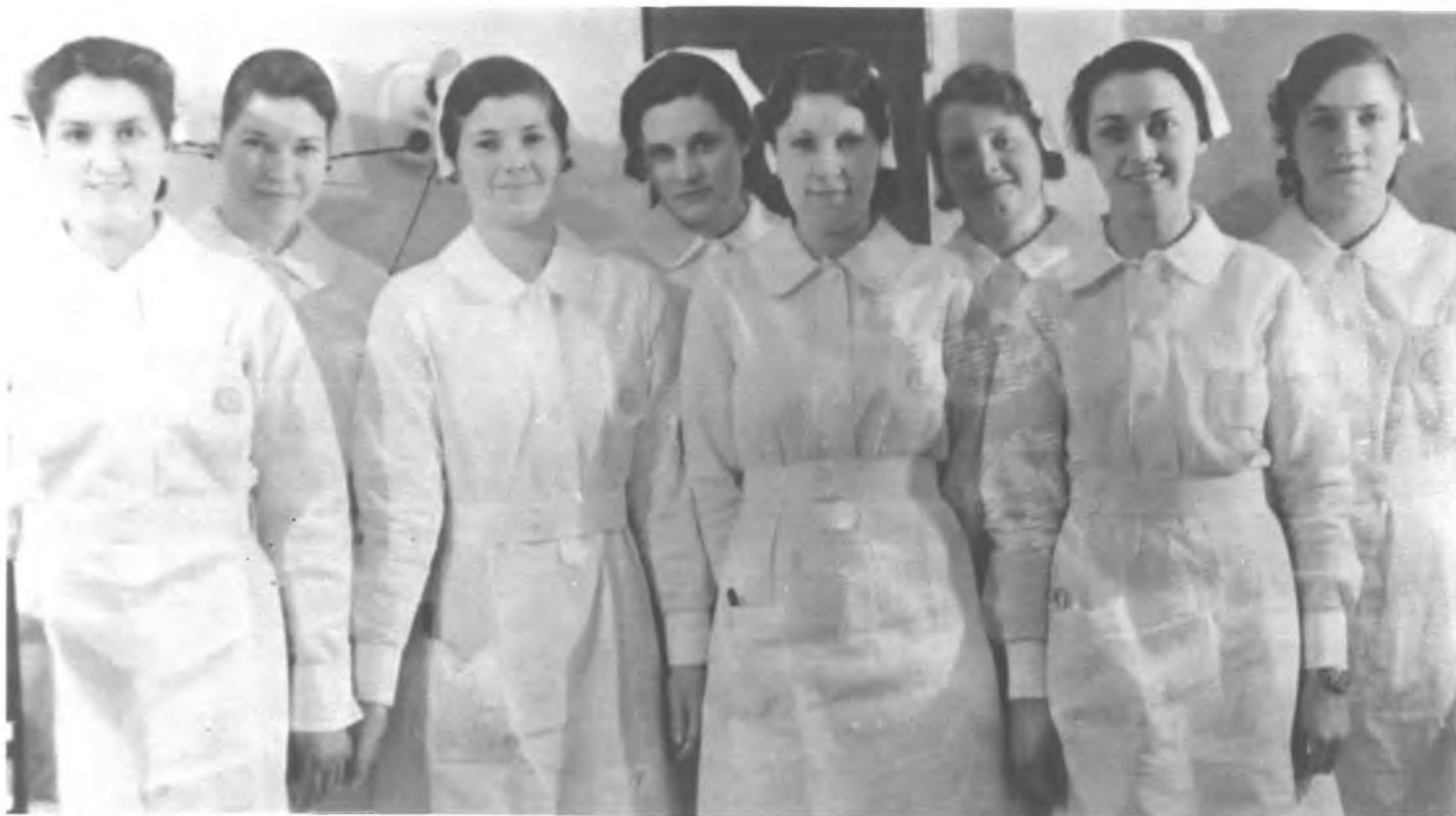
Below: nursing staff 1935