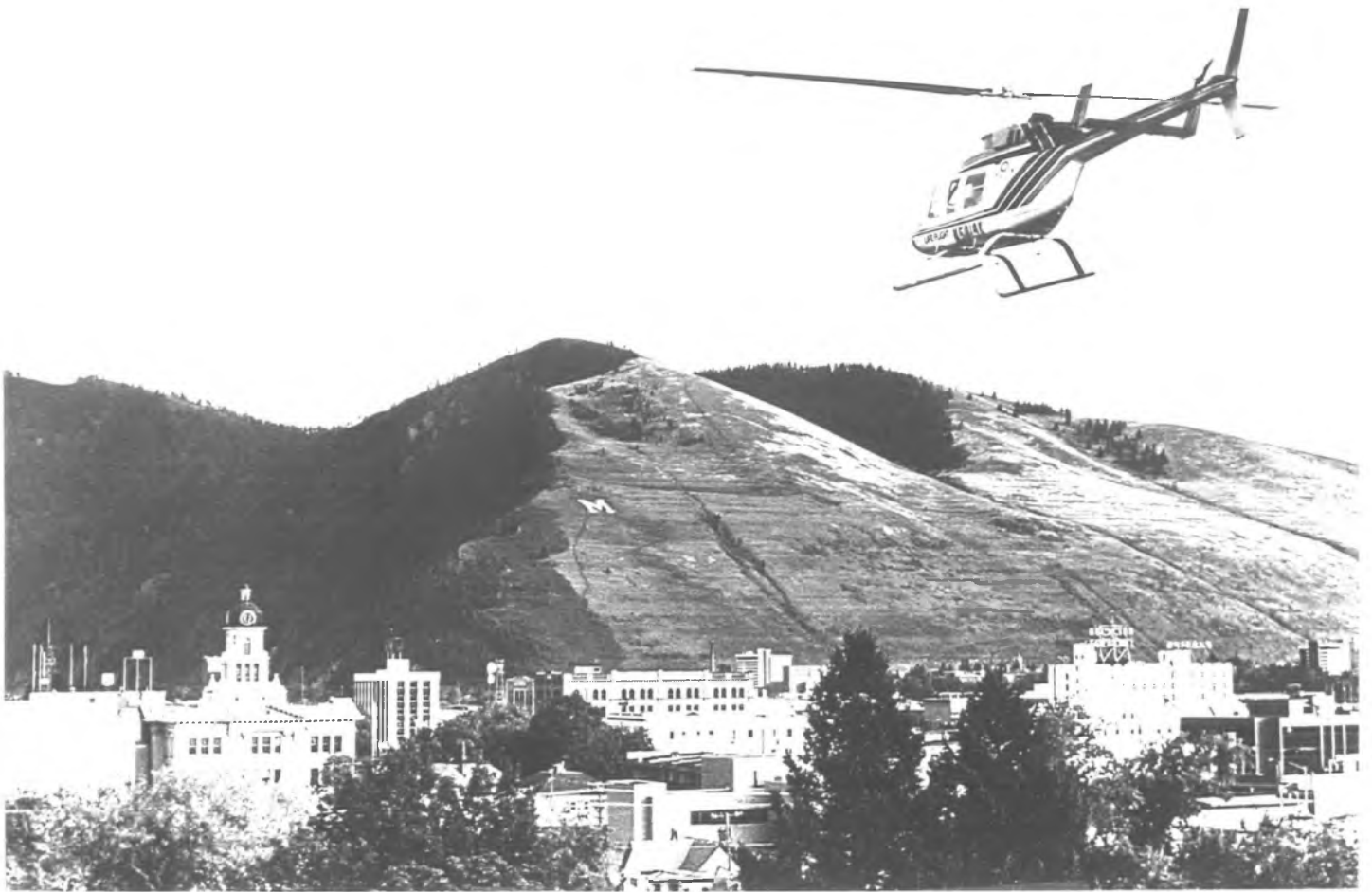
Life Flight Helicopter 1984