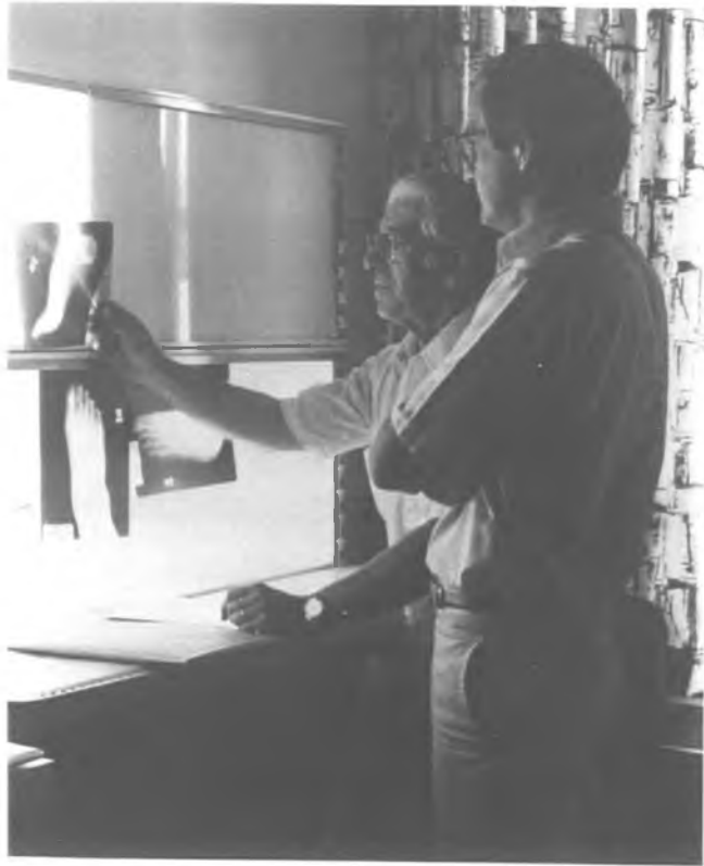
X-ray department 1984