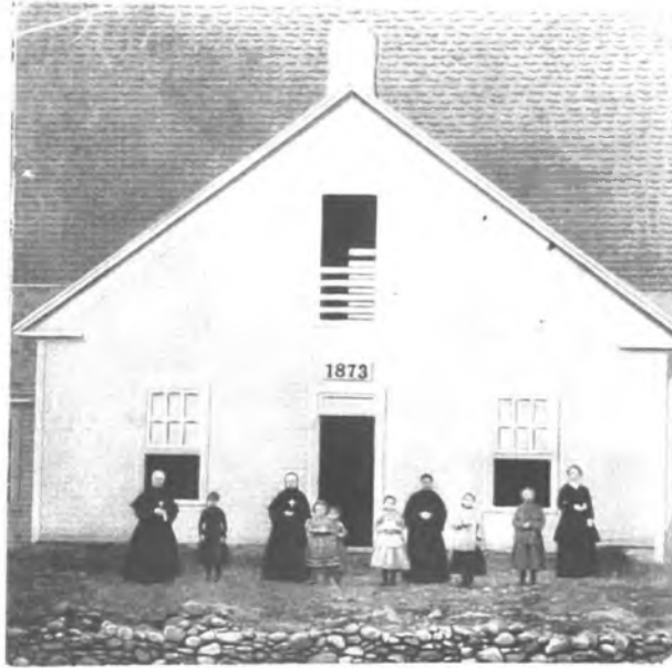
Sisters and children in front of 1873 building