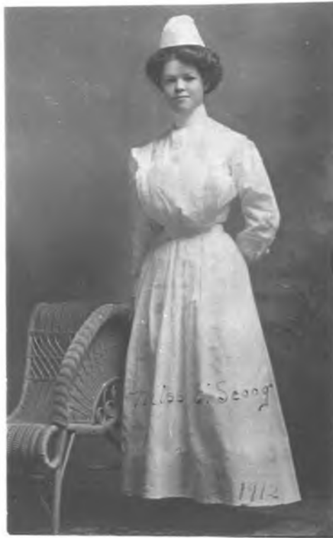
1912 nurse's uniform