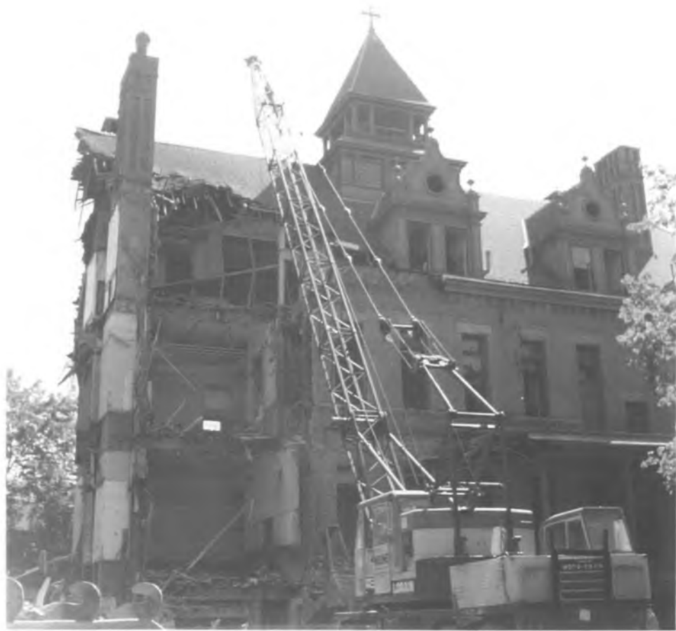
Demolition of Sacred Heart Academy for construction of present hospital on same site