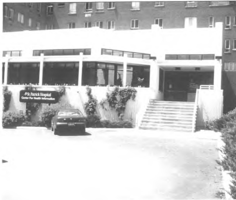
Center for Health Information, St. Patrick's