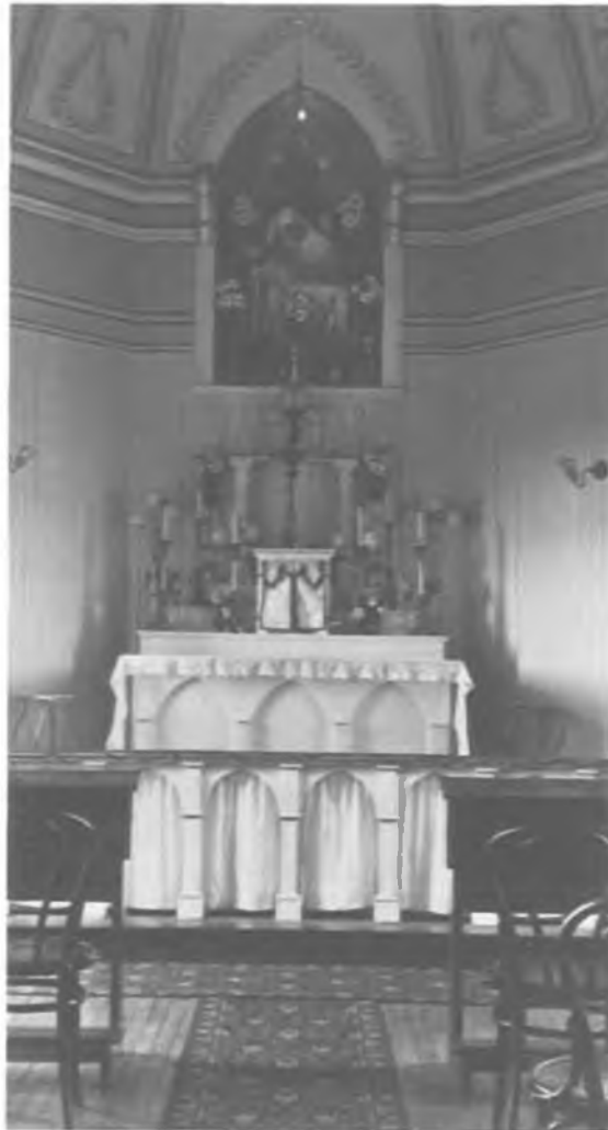
The altar of the chapel at Holy Cross Hospital is pictured here in 1912.