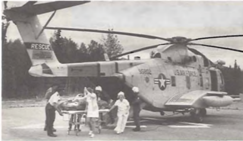
Providence handles an emergency situation.