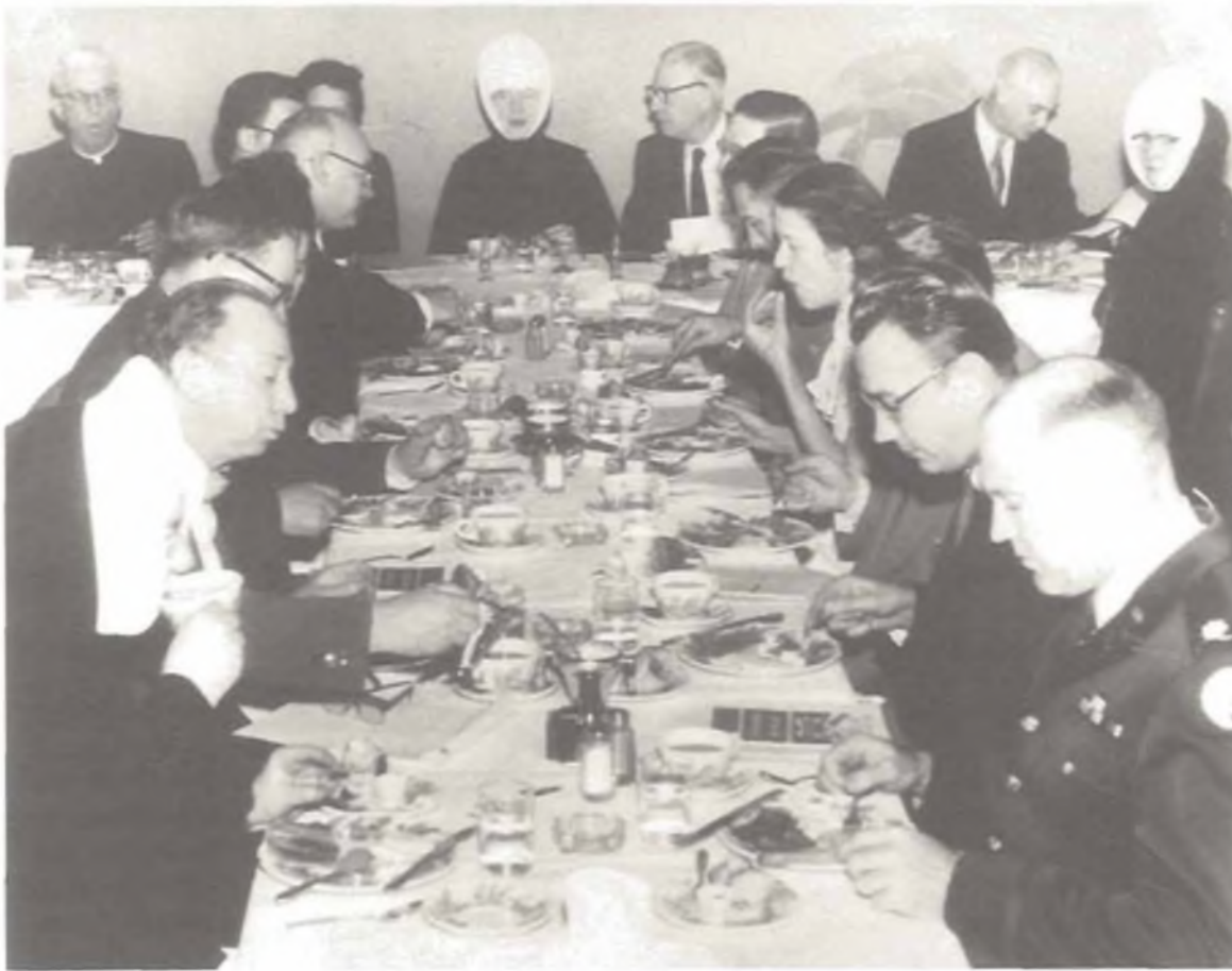
The first lay advisory board at Providence Hospital was formed in 1955.