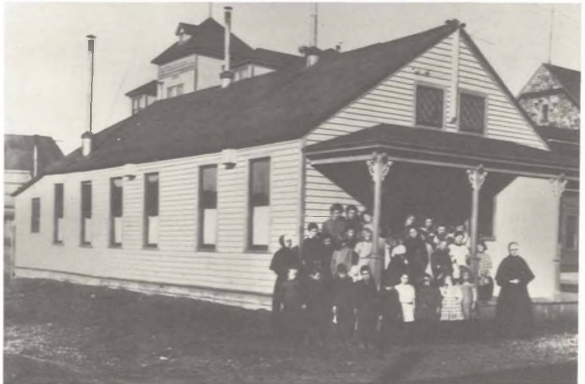
Students and the two teaching Sisters of Providence assemble in front of St. Joseph School in Nome.

By the end of the first school year five girls had completed the grammar course and were admitted to the academic program of the public high