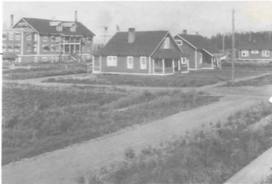
The Alaska Engineering Commission Hospital in Anchorage, circa 1924.