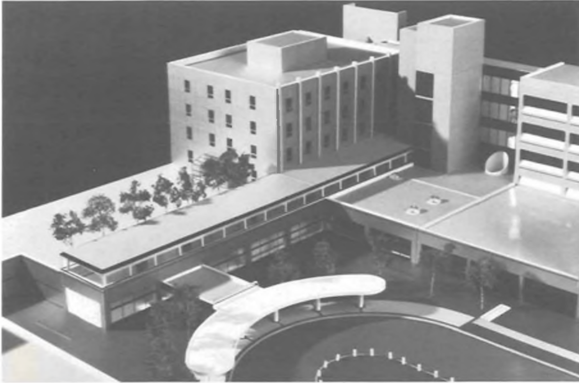
An artist's view of the completed Project 90.