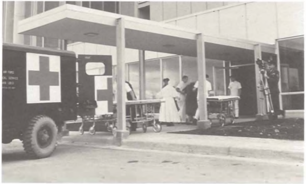
With Air Force assistance, moving day—26 October 1962—went smoothly.