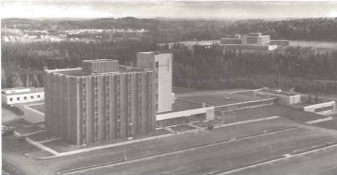
Providence Hospital in 1962.