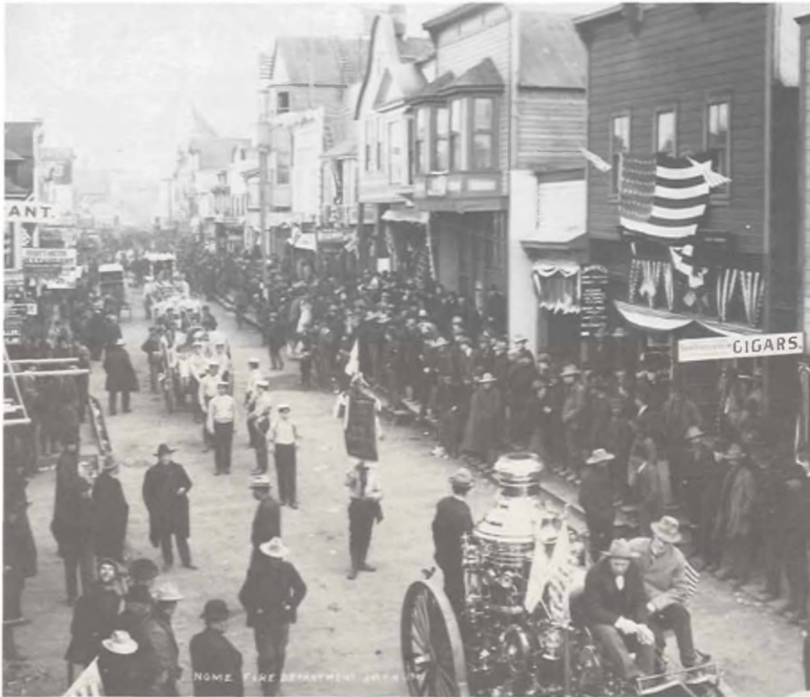
The fire department's pumping wagon parades through Nome on 4 July 1901.

to erect such a facility. The success of the community required social responsibility, a quality the general found sorely lacking. "Not a cent was offered and not a thing was done, though it was easy enough to raise five hundred or more dollars for a Fourth of July celebration." A hospital fund, the general reasoned, "would have been much better employed than in paying a band to march up and down the street, and a hospital building would be a much more enduring monument to patriotism than a few perishable bits of decora-