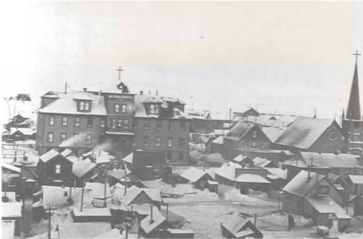
Holy Cross Hospital and St. Joseph's Catholic Church stood as solid and imposing edifices in Nome.