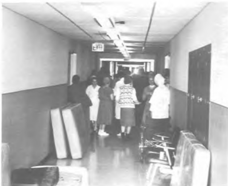
People from all over Anchorage sought refuge and aid at Providence after the earthquake.

bara Ellen if she wanted him to send the people home. "Where are they going to go?" she asked. "They don't know if they've got a home." Most were from Turnagain and Bootlegger's Cove, two hard hit, low-lying areas, and they were following civil defense instructions to go to higher ground in anticipation of a tidal wave.