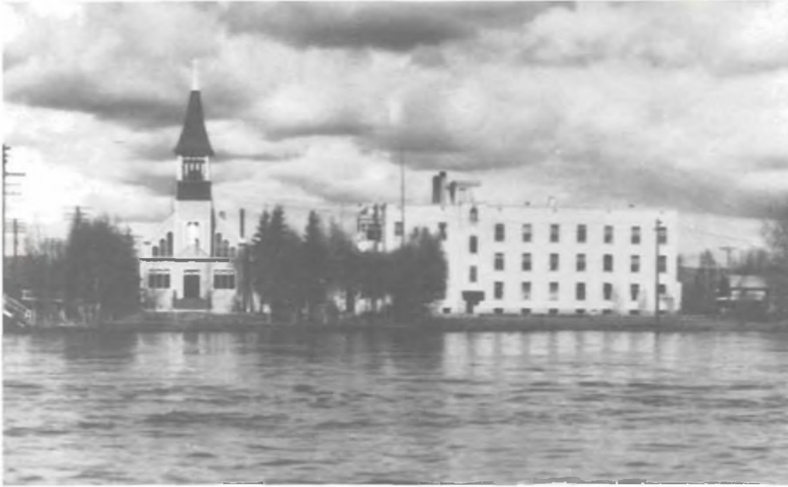
St. Joseph Hospital viewed across the cresting Chena River. The August 1967 flood overflowed the banks of the river and flooded the basement of the hospital.