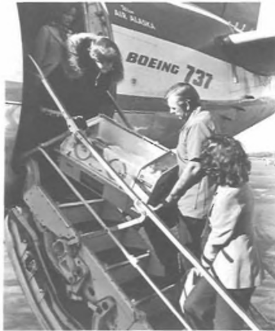
Bringing high-risk newborns in from the bush dramatically increased their chances for survival.

The newborn special care facility at Providence helped save lives and change perceptions. Many in Alaska believed that when people chose to live in the bush, they accepted the risk of poor access to sophisticated health care. The increased emphasis at Providence on care for high-risk newborns from isolated areas helped change such attitudes. In 1972 the Alaskan Newborn Care Project, a statewide program sponsored by the State