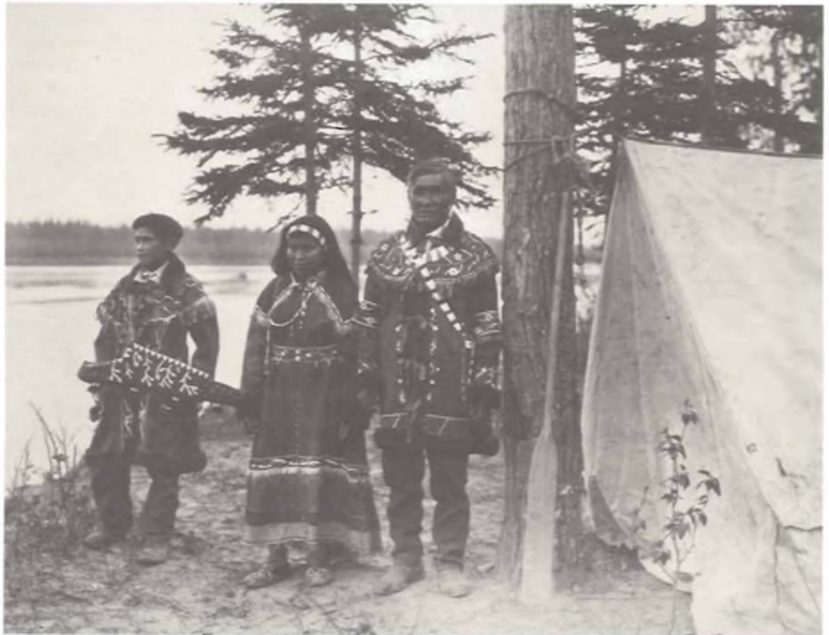
An Athabaskan family.

To the north of the southern coastal tribes lived