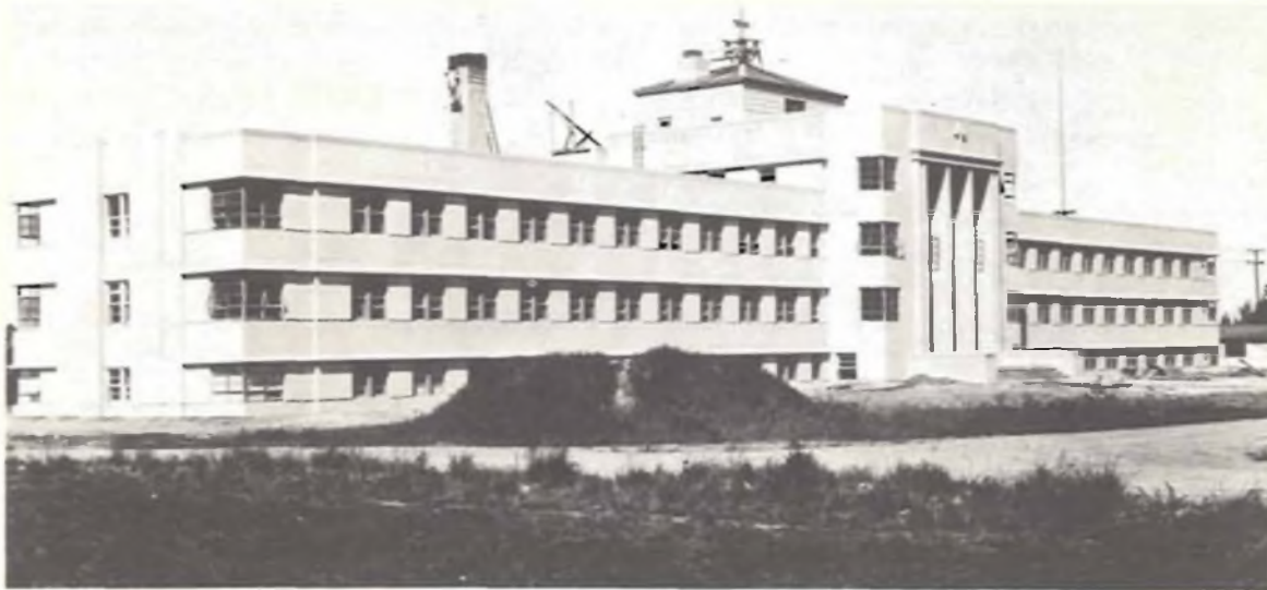
The front of the new Providence Hospital as it looked in June 1939.