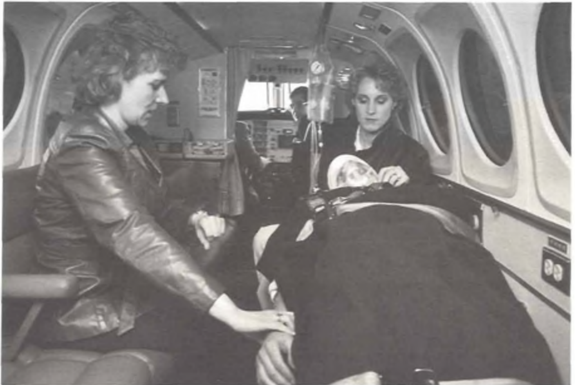
Lifeguard Alaska gives patients in the bush access to state-of-the-art health care.