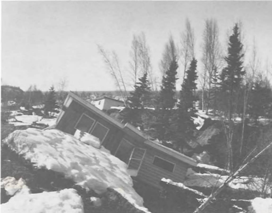
Many homes were lost amid the wreckage of Turnagain Bluff.