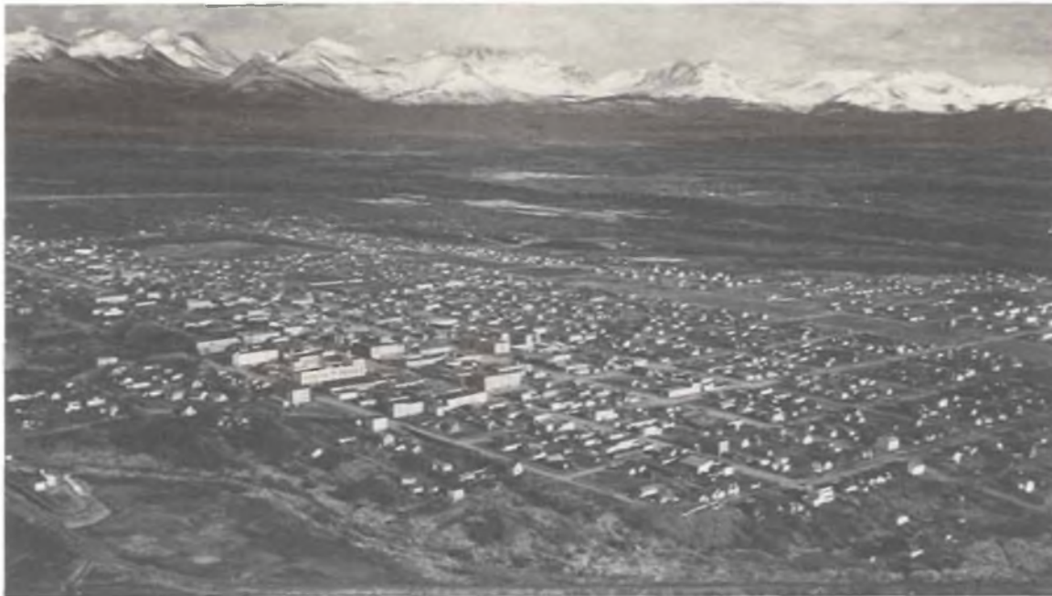
An aerial view of Anchorage in the late 1930s.